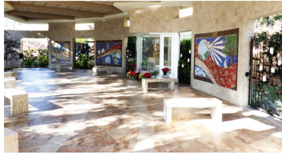
Santo Niño Shrine & Prayer Space at St. Paul Catholic Church in Tampa